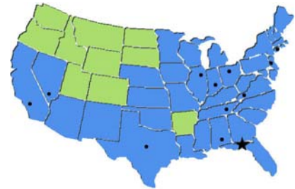
Meridian Service Area

As one of the largest providers of contract therapy and disease state management in the United States, Meridian has built a national network of clinical programs in hospitals, skilled nursing facilities, outpatient clinics, homecare centers, polysomnography laboratories and respiratory pharmacies. Meridian’s customers range from independent healthcare providers to national public companies.